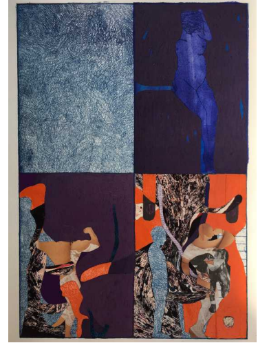
Robert Fry, Untitled, 2020, Mixed media and collage on paper, 29 x 41.5cm, Unique

Shahane Hakobyan hakobyan@galeriekornfeld.com