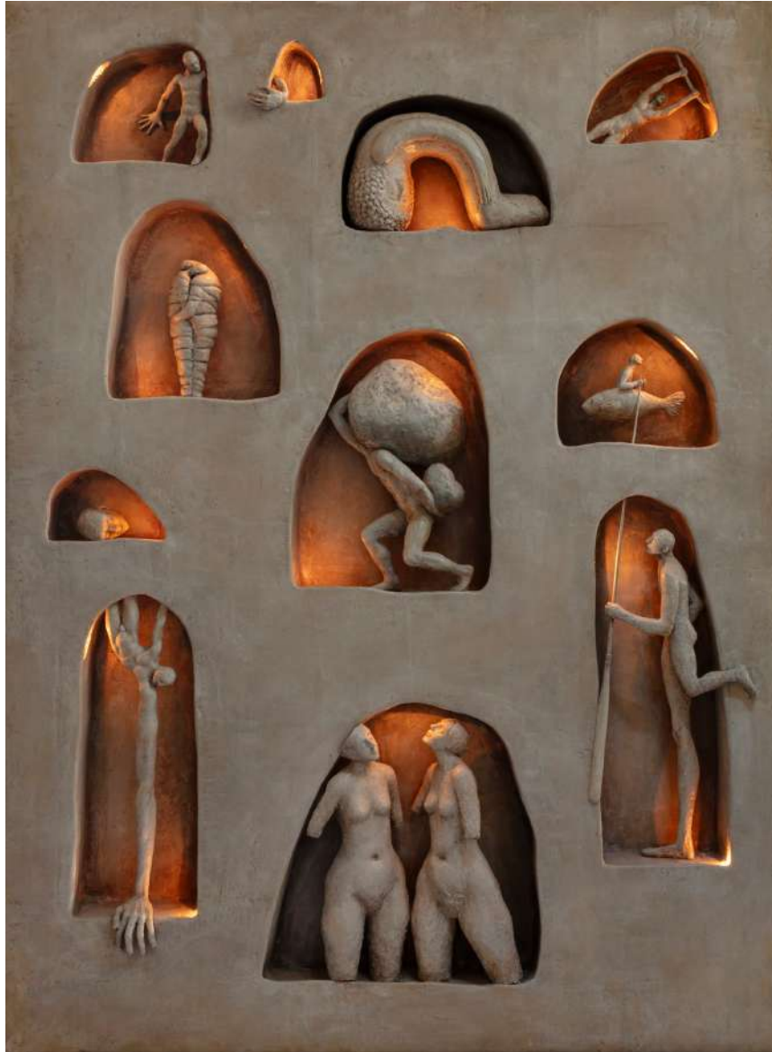
Tamara Kvesitadze Cave Tellers , 2023

Fasanenstraße 26 | 10719 Berlin +49 30 889225890 | galerie@galeriekornfeld.com